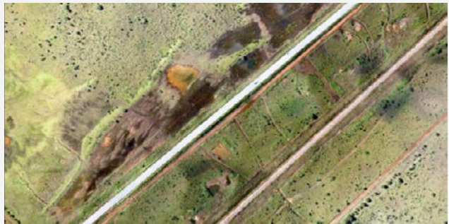
"This flight was also carried out in preparation for the deployment of the D-250 to the area," explains Houlsby. "The areas on each side of the road have been surveyed as Confirmed Hazardous Areas. Flights such as these could for mechanical deployment planning, as they give more detailed imagery of land that is not visible from the ground."