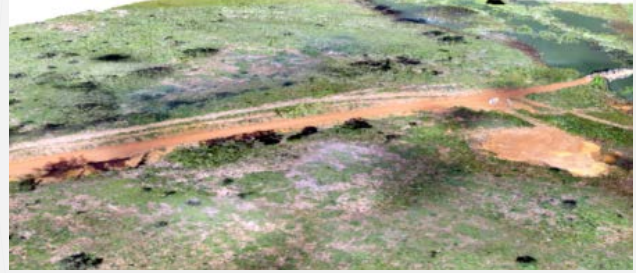
The HALO Trust will use a Swiss-produced Digger Foundation tilling machine in its clearance operations. The data above—an ArcScene representation of an orthomosaic with the DSM as base heights—was used for slope analysis, which it is thought could prove useful in determining suitable access routes for the machines to reach the sites.

Last but not least, the drone's data allows mine action teams to more accurately record changes in land use, by providing precise before and after imagery. "Using the imagery from the drone, we've been able to produce interesting webmaps and case studies to demonstrate the impact of mine clearance for vulnerable communities. We took historical ArcGIS Online imagery from before clearance and compared it to detailed post-clearance drone imagery. It's a really effective way to communicate change."