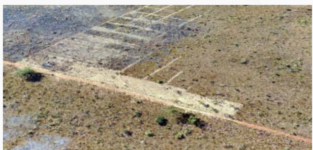
A drone-produced orthomosaic combined with a digital surface model, shown in Esri ArcScene, that details the extent of clearance by manual deminers on a HALO Trust minefield (the clearance activity is visible as a lighter coloured grid).