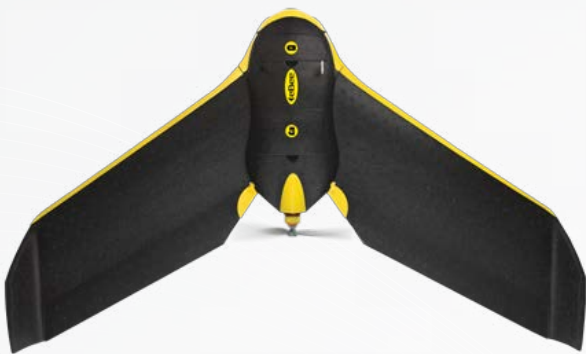
In its operational testing phase, the GICHD now works with senseFly's eBee mapping UAS.

The GICHD mapped the benefits and challenges of using UAS for mine action operations via several online surveys that its team conducted between 2012 and 2014. "The purpose of these surveys was to identify user needs and explore the potential use of UAS in humanitarian mine action," Cruz explains. "The 42 respondents comprised representatives of international mine