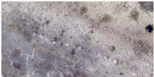
Craters from the controlled demolition of anti-vehicle mines in a minefield in Cuito Cuanavale, Angola. New crop cultivation, planted after the demolition, can be seen within metres of the mine line.