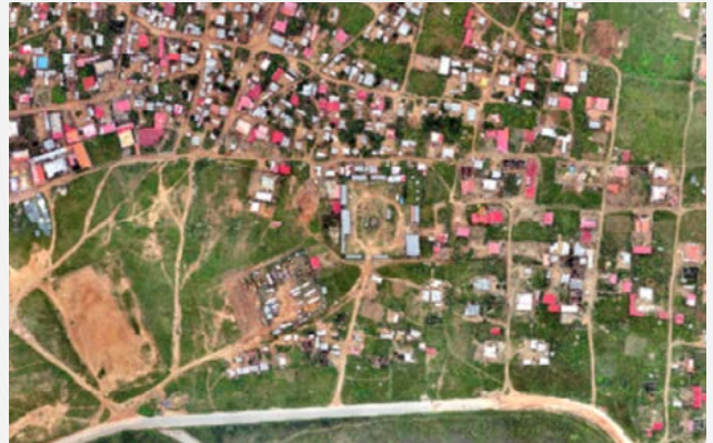
A drone-produced orthomosaic, or map, showing The HALO Trust's compound (centre) in Kuito, central Angola. The northern section of this compound, plus a large part of the bairro around it, was previously a minefield, which was subsequently cleared by The HALO Trust.