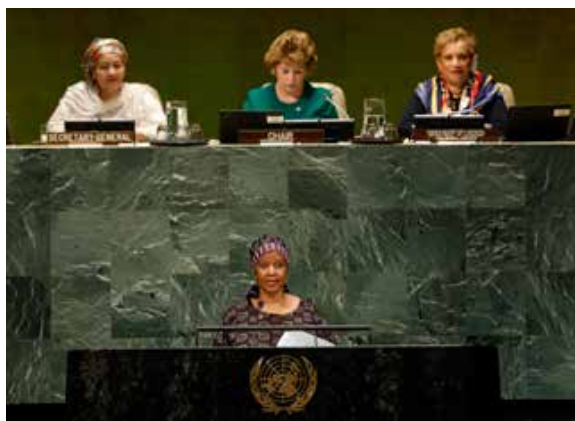
Above: Opening of the 63rd Session of the Commission on the Status of Women

A Working Group comprised of balanced representation from statutory bodies, civil society and academic experts with relevant experience of the WPS Agenda was established for the development of the NAP. Nominations were sought from the Oversight Group of the second NAP and members were appointed by the Tánaiste and Minister for Foreign Affairs and Trade. There was a focus on diversity and inclusion within the nomination process. The group's role was to advise and inform the development of the third NAP. It had an independent Chairperson and the Conflict Resolution Unit provided a Secretariat. 6