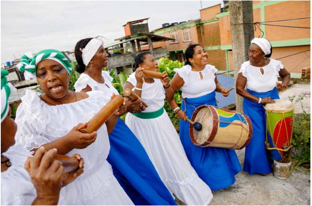
Colombia - preserving Afro-Colombian Culture through song