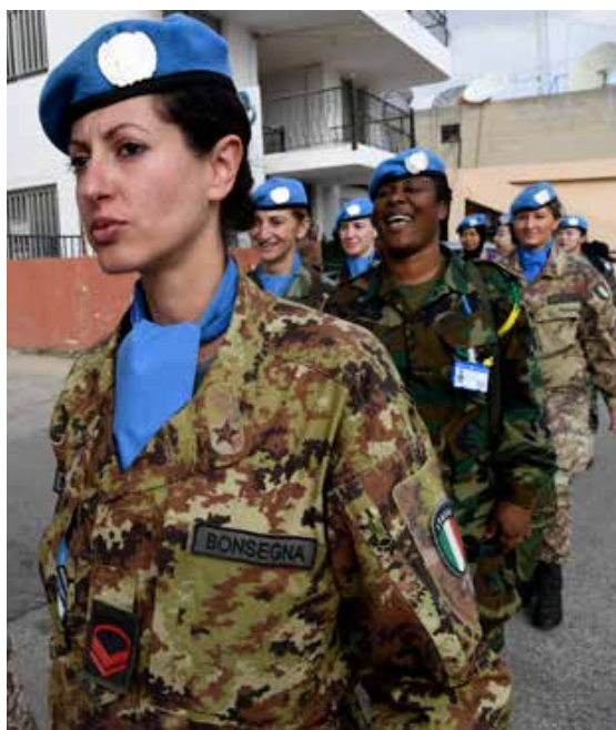
Women Peacekeepers in Lebanon with UNIFIL

The United Nations Security Council Resolution (UNSCR) 1325, was adopted in 2000, and marked a watershed moment when the international community recognised the particular impact of conflict on women and girls. UNSCR 1325 has been reinforced by eight subsequent resolutions and is structured around thematic pillars. The Women, Peace and Security (WPS) Agenda recognises both the particularly adverse effect of conflict on women and girls, as well as their critical role in conflict prevention, peace negotiations, peacebuilding, mediation, and governance.