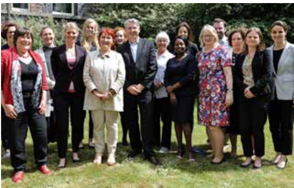
Regional Acceleration Resolution 1325 Workshop, June 2018, participants with Secretary General Niall Burgess (centre)

This involves not only raising our own voice in support of the WPS Agenda but also working to raise the voice of women peacebuilders across Ireland and around the world. Through partnerships at the European Union, United Nations and African Union, as well as our partnership with the international financial institutions we will drive collective action to achieve the commitments under the WPS Agenda.