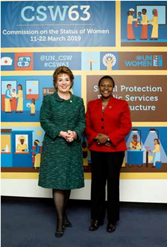
CSW63 - Closing Session. Ireland’s Permanent Representative to the United Nations Ambassador Geraldine Byrne Nason Kenya’s Deputy Permanent Representative to the United Nations, Ambassador Koki Muli Grignon

This third plan takes into account the recommendations of evaluations and reviews of the previous plans and the changing and increasingly complex nature of contemporary conflict. It reflects a strengthened focus on ensuring an integrated and holistic approach to conflict prevention, the conclusions of the UN 2015 Global Study on the implementation of the WPS Agenda 3 , the agreement of the UN Sustainable Development Goals, and the adoption of the EU Strategic Approach 4 to WPS.