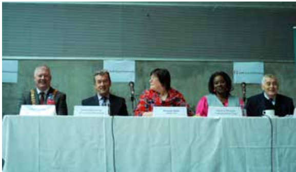
Expert panel during the Public Consultation in Cork on the development of the National Action Plan