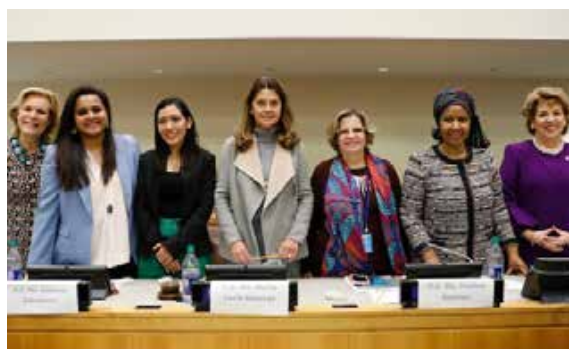
"Take the Hot Seat" Intergenerational Dialogue

These assumptions have been considered in the creation of the actions and indicators in the NAP in order to mitigate risk of inability to achieve the objectives of the plan. They will continue to be revised and taken into consideration throughout the duration of the NAP, particularly during the annual reporting and Mid-Term Review and Final Evaluation.