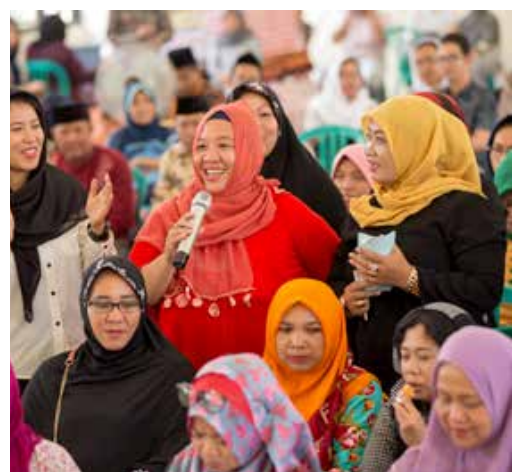
Indonesia - Community Peacebuilding Discussions.