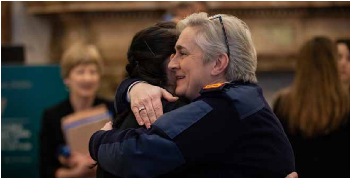
Public Consultation Workshop, Iveagh House, Department of Foreign Affairs and Trade.