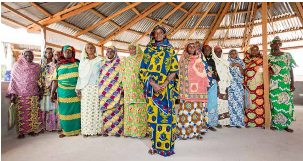
UN Women Humanitarian Work with Refugees in Cameroon.

The United Nations Security Council Resolution (UNSCR) 1325, was adopted in 2000, and marked a watershed moment when the international community recognised the particular impact of conflict on women and girls. UNSCR 1325 has been reinforced by eight subsequent resolutions and is structured around thematic pillars. The Women, Peace and Security (WPS) Agenda recognises both the particularly adverse effect of conflict on women and girls, as well as their critical role in conflict prevention, peace negotiations, peacebuilding, mediation, and governance.