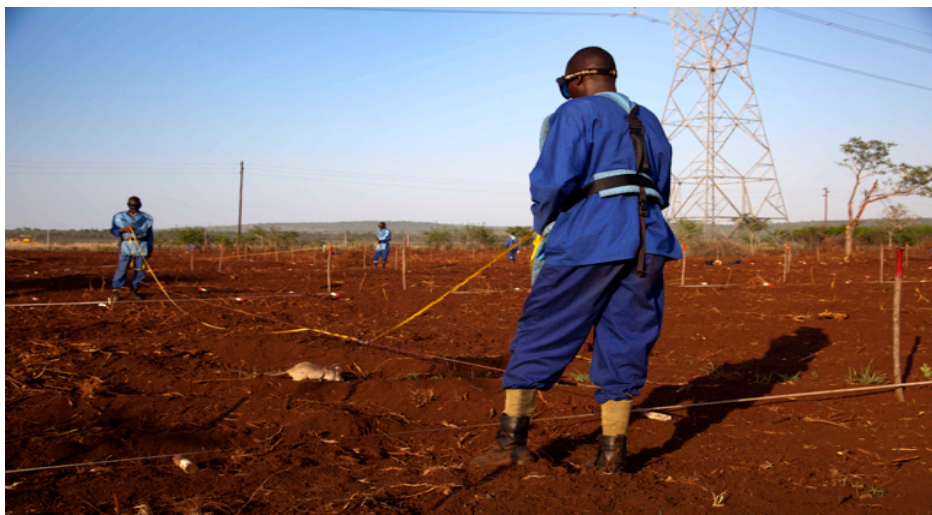
Figure 3. MDR operations with rope system after a tiller, Maputo Power-line Task, Maputo Mozambique

In total, 306,244 square metres of land was released, of which 213,885 square metres was searched by the manual demining teams (full clearance) and 92,359 square metres processed by tiller and searched by the MDR teams (technical survey) with 556 landmines and 37 items of UXO safely located and destroyed.