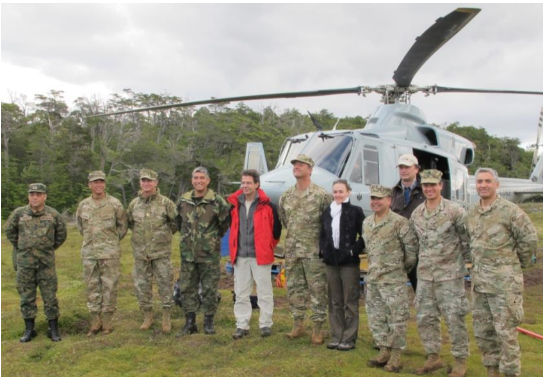
The visiting team and hosts about to board the Bell 412 SP helicopter following the visit to the 'Packsaddle' minefield at the Picton Islands in January 2013.

The GICHD recommends the Chilean Navy revisits its procedures planned for the demining operation on the Picton Islands. The current procedures are exposing the operator to unnecessary risk as he/she will have to approach every single mine with an explosive disarmament method twice. The GICHD recommends that the Navy demining team develops SOPs based on the recommendations found in this report.