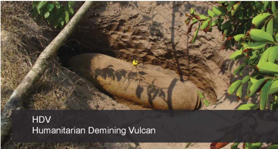
HDV Humanitarian Demining Vulcan

An alternative to the SM EOD point focal charge.