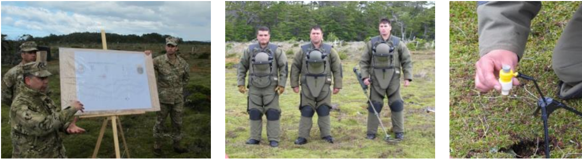
Images from the mine clearance demonstration at Picton Island.

The demonstration gave an example of the professionalism and expertise within the Chilean Marines demining unit. It also showed that the equipment and support functions at hand are of world class. The command and control of the site seemed tidy and adequate for a minefield of such type as the ones found on Picton Island. Two observations were, however, discussed as a result of the demonstration and the later brief and subsequent tour of the minefield in question (Packsaddle):