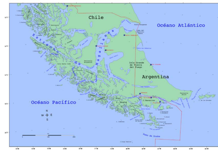
Map of the southern part of South America.

Picton, Lennox and Nueva is a group of three islands (and their islets) on the extreme south of South America, in the Chilean commune of Cabo de Hornos. They are divided between the Antártica Chilena Province, Magallanes and the Antártica Chilena Region. They lie east of Navarino Island and are separated from the Argentine part of Isla Grande de Tierra del Fuego in the north by the Beagle Channel.