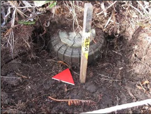
SB-81 mines were located and partially exposed by deminers, then recovered by CK

AT mines were located, identified and partially uncovered by the deminers, but left in place. CK photographed each mine in position before fully uncovering and lifting. The mines were then assessed to establish that it was safe to disarm them, and were defuzed inside the minefield.