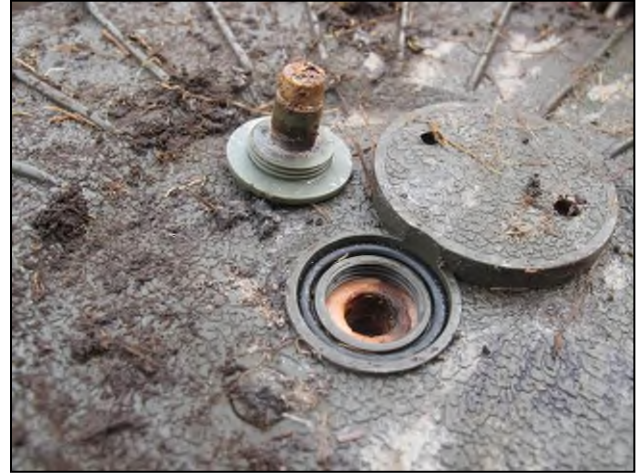
AT mines were examined and then defuzed in the minefield. The condition of detonators was noted