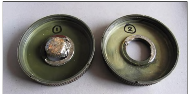
View of the foils from the inside of the casing