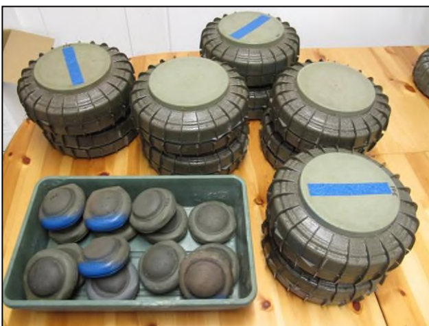
A number of mines were reassembled, inert ('FFE')