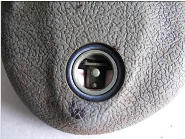
An SB-33 detonator plug removed to reveal the detonator still in position, impaled on the firing pin

The presence of the firing pin in the stab receptor of the detonator is a major and unexpected hazard, since further movement could cause initiation. During disarming, the detonator is withdrawn from the mine body at right angles to the firing pin, meaning that the two components scrape together. If the detonator is still active, this could initiate the mine in the hands of the deminer.