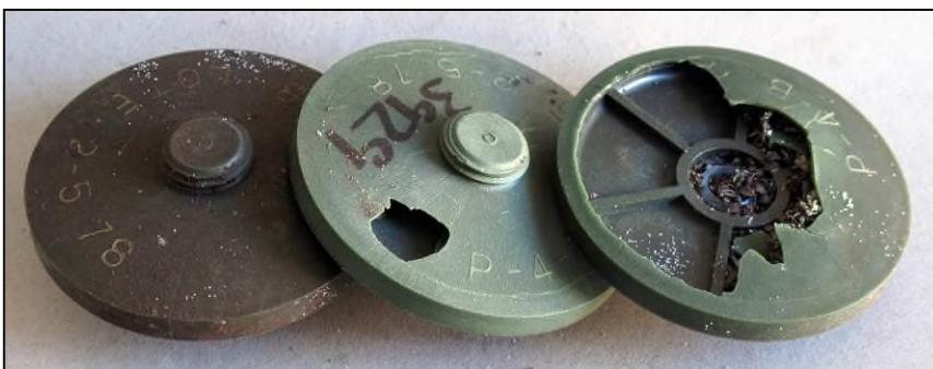
A range of degradation was present among P4B fuze casings

Any corrosion of the striker spring reduces its metallic mass and makes it even less detectable.