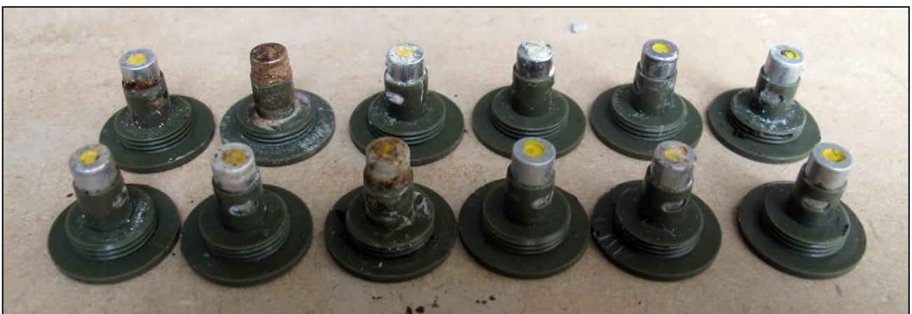
Detonators from the SB-81 mines, some of which show signs of deterioration

Most detonators appeared to be in good condition; however, some had white crusting (probably aluminium oxide from the detonator capsule) while others had a brown gelatinous exudation from the stab receptor.