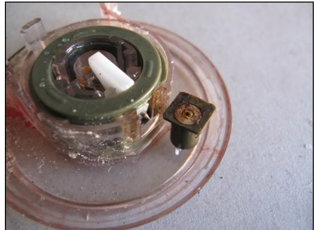
An SB-33 disassembled, showing the pin in the fired position and a hole visible in the detonator

A further 4 mines were recovered with no detonator plugs present. It was initially assumed that these mines had been laid unarmed, without plugs, but examination showed that all had been actuated.