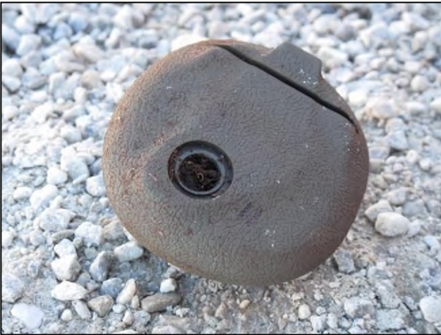
Several SB-33 mines had detonator plugs missing and were initially assumed to be unarmed