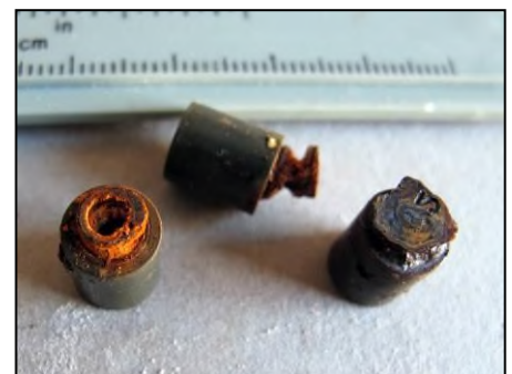
Many springs were corroded