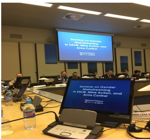
NATO Seminar on Gender Mainstreaming in SALW, Mine Action, and Arms Control, Brussels. November 2016.

For International Women's Day on 8 March 2016, the GICHD held an informal lunchtime discussion on gender bias and its personal and professional impacts. Approximately 20 staff members participated, took a test on their unconscious bias, and discussed their results together, and were delivered a toolkit on dealing with their bias.