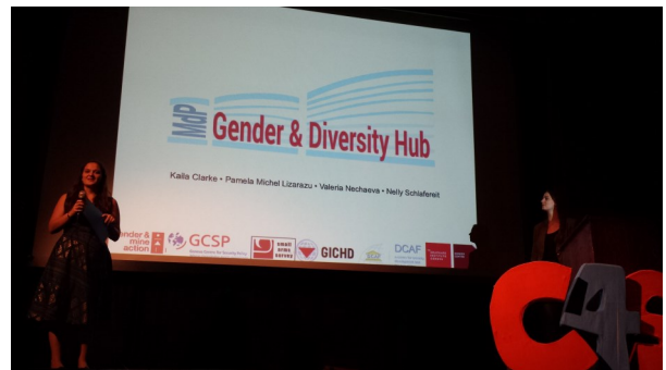
The team of C4SI students during Demo Day, presenting their innovative solution to a live audience. November 2016.

Collaborate for Social Impact (C4SI) | September to November | Experiential program that challenges students to answer real-life problems identified by international organisations. In September, the G&D Hub challenged a team of students to identify what type of initiative could promote and enhance engagement on gender & diversity in peace and security among the MdP. The team presented their solution to the challenge in November. Their solution is currently being revised by G&D Hub members.