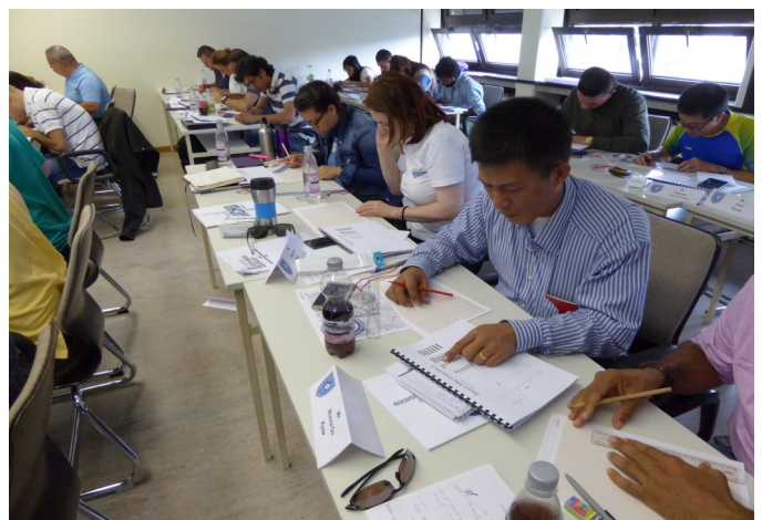
Non Technical Survey Training in Hammelburg, September 2016.

The Online Training Platform (OTP), which will be piloted in 2017, is meant to centralise information on training courses and their participants. In the future, it will provide more comprehensive and systematic sex and age disaggregated data on training participation.