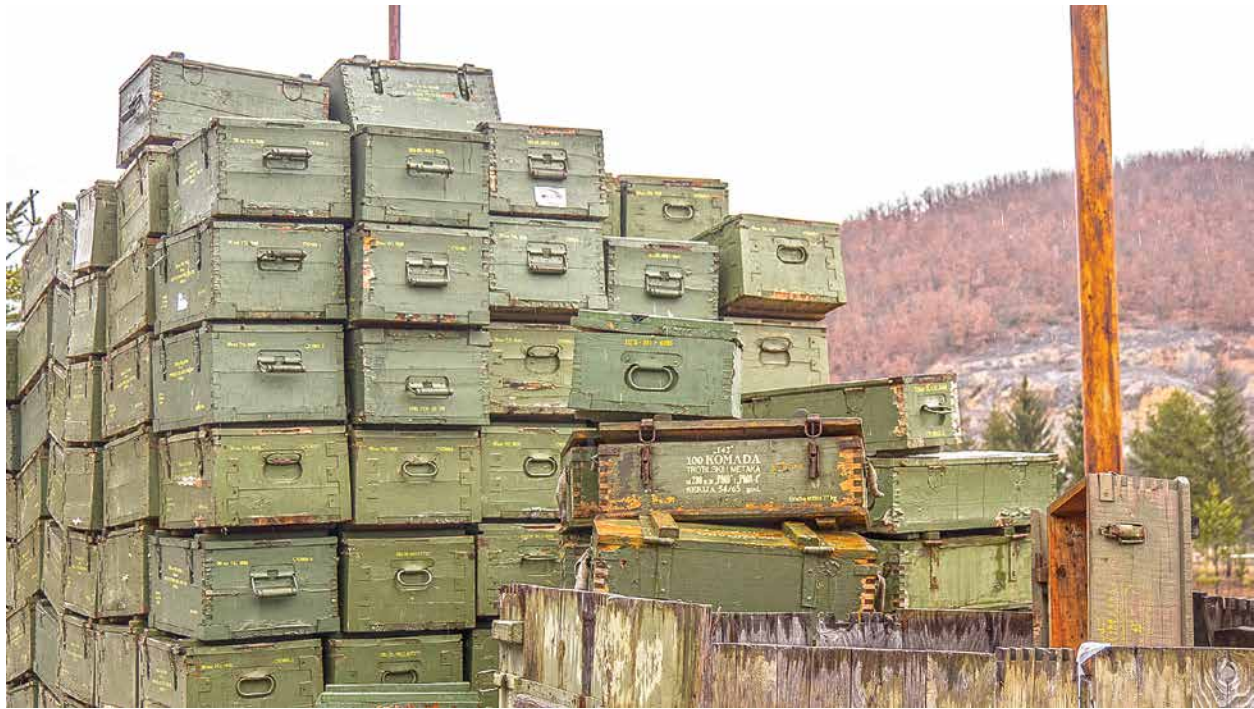
An example of an exposed, insecure, and potentially unsafe stockpile of ammunition in Kosovo.

Deliberate efforts are now needed to ensure that the various political initiatives do not duplicate one another. The U.N. General Assembly track has thus far prompted substantive exchanges on trends in diversion and on the provision of technical assistance and capacity building, thereby clarifying current gaps and possible remedial actions concerning ammunition safety and security. Concurrently, the rather regional and more ‘operational’ SSMA initiatives of Switzerland and the A.U. could be harnessed to complement and enhance the General Assembly platform.