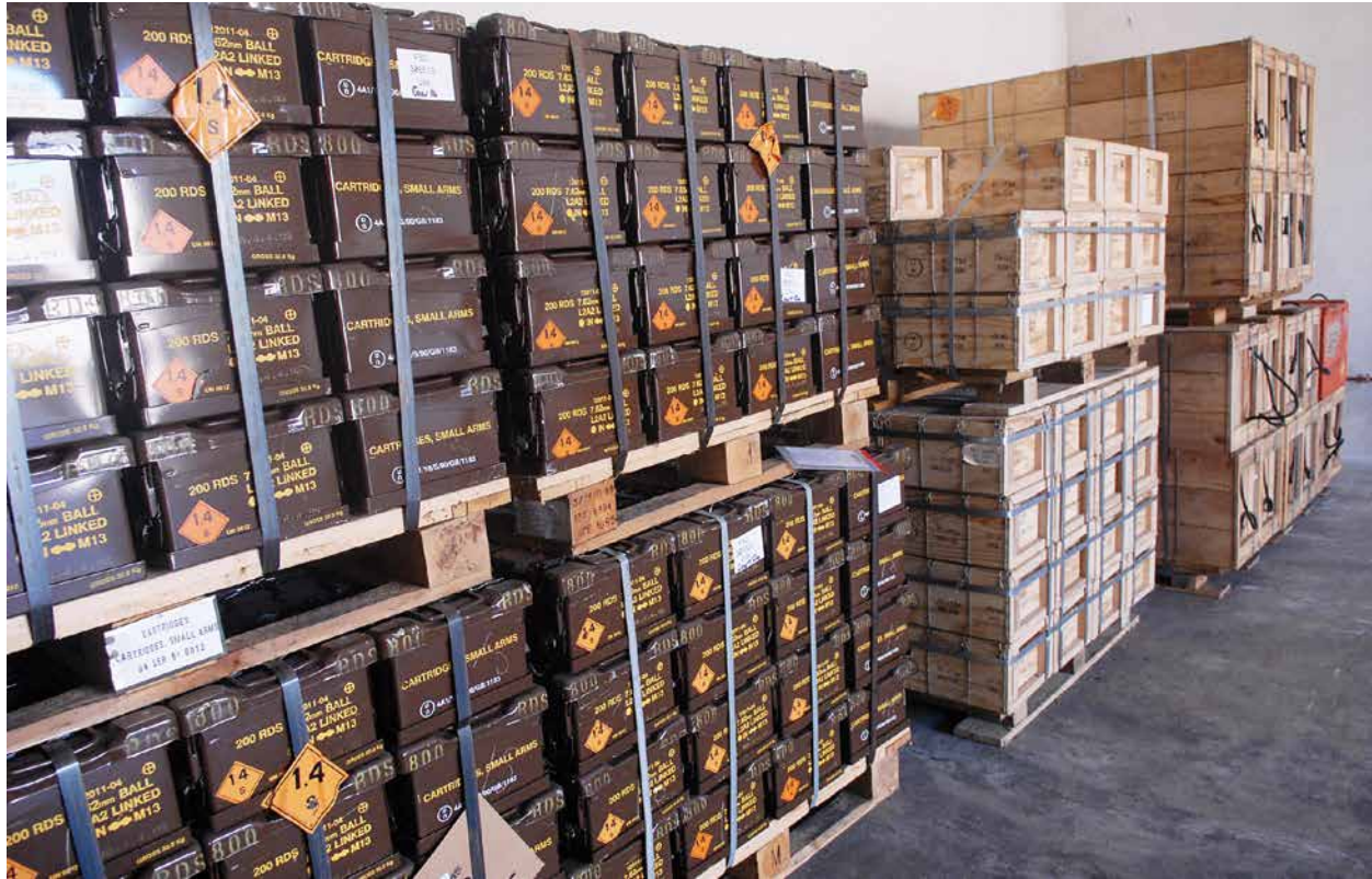
A good example of an ammunition depot: ammunition warehouse ASP 7 (Ammunition Supply Point 7), Italy.

treaty-related international cooperation and assistance. 11 It remains to be seen how ATT States Parties will concretely share good practices and report on effective measures taken to address the diversion of transferred ammunition. 12