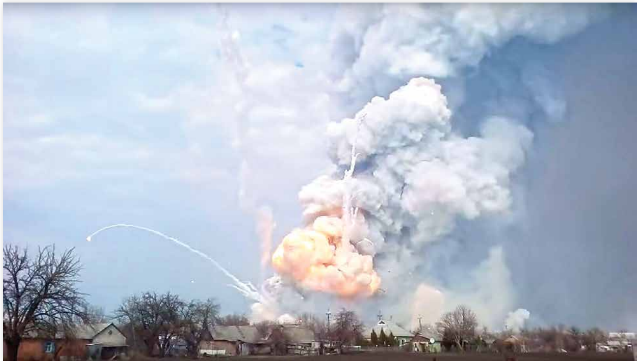
The terrifying scale of the blast of an arms warehouse that sparked a mass evacuation of 20,000 people in Balakleya, Ukraine, March 2017.