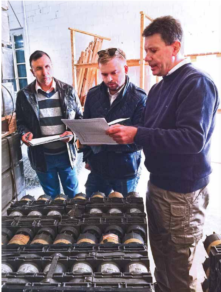
GICHD Ammunition Safety Management training, Switzerland, 2015.

required across state institutions on the accountability of the state for ammunition management. Sensitizing and involving oversight bodies such as parliaments could be considered to that effect. Moreover, national commitment may need to be nurtured from the top all the way down to the keeper of a local ammunition store. To do so effectively, trust building over time is essential and presupposes a long-term partnership with international stakeholders.