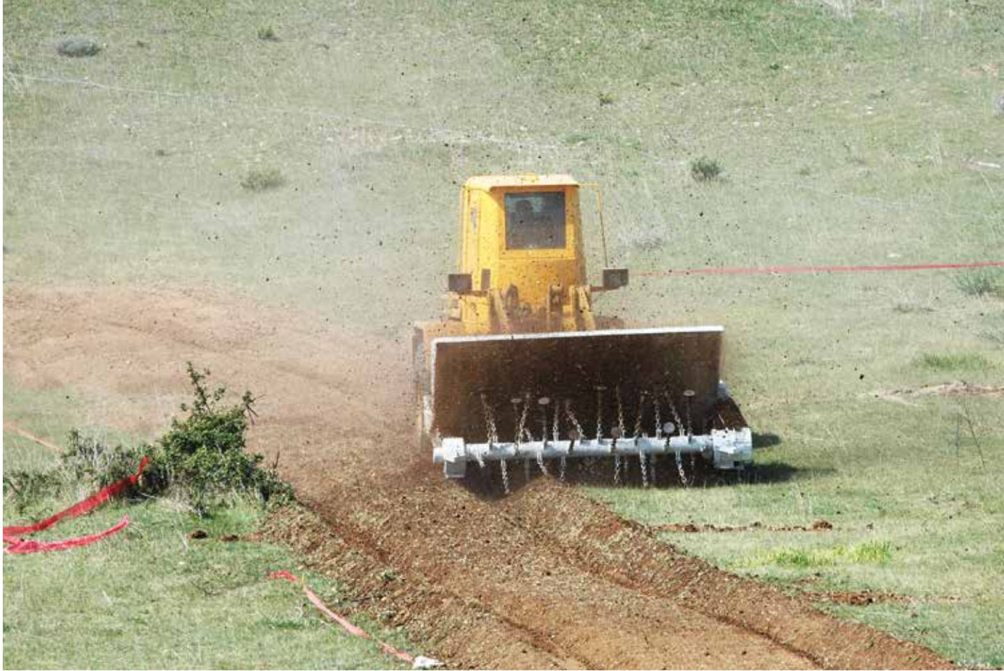
Mechanical demining in action.

deforestation, possibly affecting entire populations of species by damaging habitats and altering food chains. 8,9,10